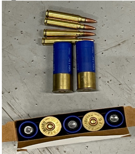
Figure 2. CBP Ammunition