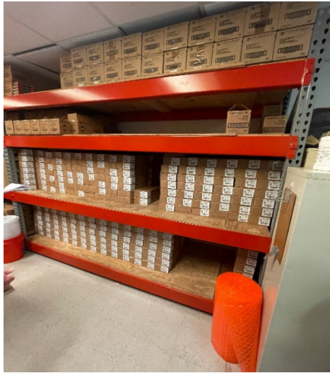
Figure 5. Example of Ammunition Stored at a CBP Facility