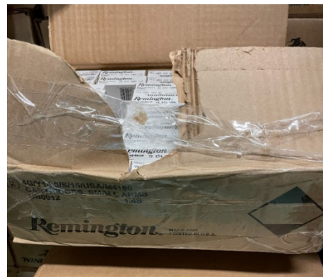
Figure 6. Ammunition Box Resealed with Tape

The same location shared the ammunition vault with a local CBP Special Response Team (SRT) that used a paper log to record ammunition removed from the physical vault. This ammunition was then stored by the SRT at a separate location inaccessible to the CBP personnel responsible for ammunition accountability in the vault and contributed to the discrepancies noted above. Since our site visit, personnel at