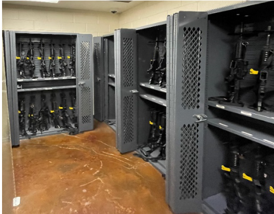
Figure 3. Firearms Stored at a CBP Facility