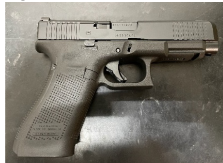
Figure 1. Typical CBP Firearm