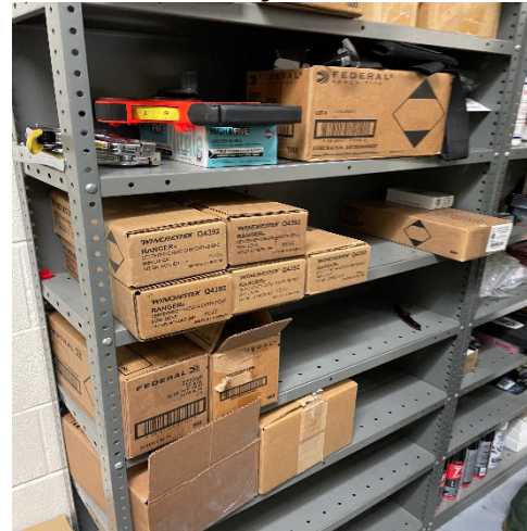
Figure 4. Ammunition Stored at a CBP Facility

CBP and DHS have several policies, memorandums, and guidance related to accountability and control of ammunition. CBP's use of force handbook states as ammunition inventory changes, it shall be accounted for and recorded in FACTS. According to CBP's memorandum, Tracking Ammunition in FACTS , all ammunition received, used, and transferred shall be captured in FACTS and shall be accounted for down to the single round. Additionally, no CBP location shall maintain "off the books" quantities of ammunition without the written consent of the Executive Director of the LESC. CBP requires responsible supervisory personnel to ensure ammunition inventory is, at a minimum, recorded in FACTS monthly. Figure 4 shows ammunition stored at a CBP facility.