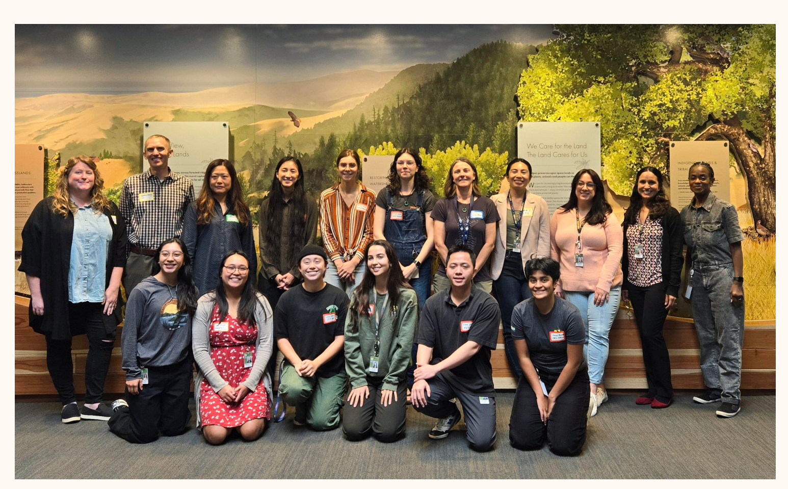
Interns and Supervisors at the 2024 Midpen Networking Event