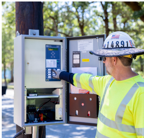
Advanced recloser control

We closely monitor any wildfires burning near our infrastructure, including power lines, poles and substations. If a fire gets close to our equipment, we will take measures to safeguard against its potential impact through a targeted, emergency de-energization to prevent damage to our facilities and the surrounding environment and to protect first responders.