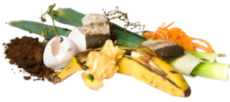
ALL FOOD INCLUDING MEAT & DAIRY