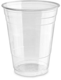
CLEAR PLASTIC CUPS