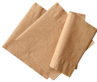
NAPKINS (BROWN PREFERRED)