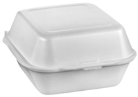
POLYSTYRENE CUPS & CONTAINERS