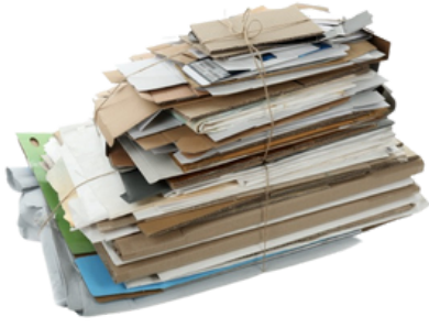
PAPER & CARDBOARD BOXES