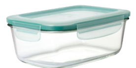
REUSABLE FOOD CONTAINER