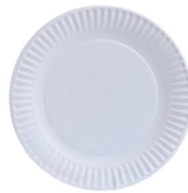
PAPER PLATES (NO WAX OR PLASTIC LINING)