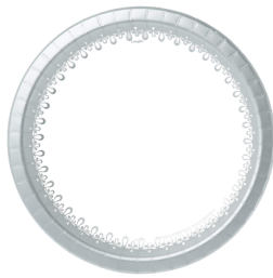
PAPER PLATES WITH WAX OR PLASTIC LINING