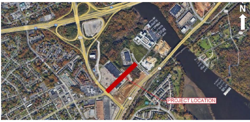
Project Location Map

Delivery Method: The project is being delivered using the Design-Bid-Build delivery method with PWCDOT administering the project and JMT providing design consultant services. VDOT will have oversight as it is a Locally Administered Project (LAP). Once final design is complete, the project will be issued for open bid to procure a contractor to begin construction.