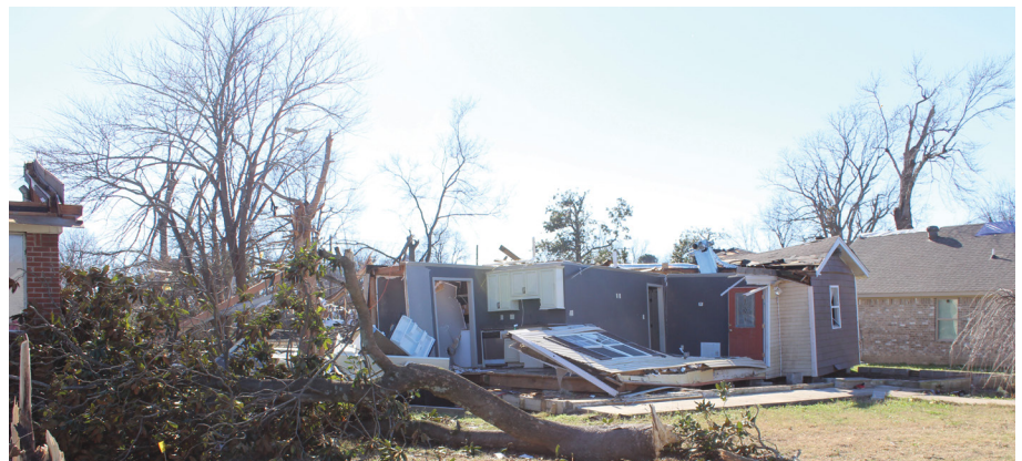
Tornadoes tore apart this Arkansas home. Housing remains one of the most common barriers to recovery. The Red Cross is working with local nonprofits to help residents overcome these barriers and find permanent housing solutions.

Contractors working with the All Hands and Hearts program will build at least 20 tornado shelters, some of which will be shared by households near one another. In addition to construction, All Hands and Hearts will help