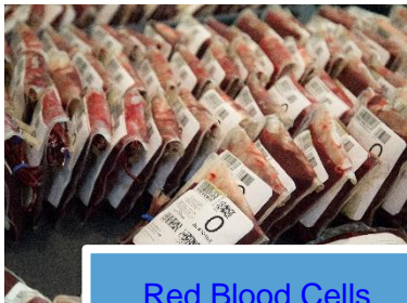
Red Blood Cells