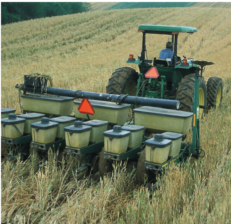
No-till planting of corn into cover crop of barley. Washington County, Virginia.

*See guidelines for details on the RMA summer fallow practice.