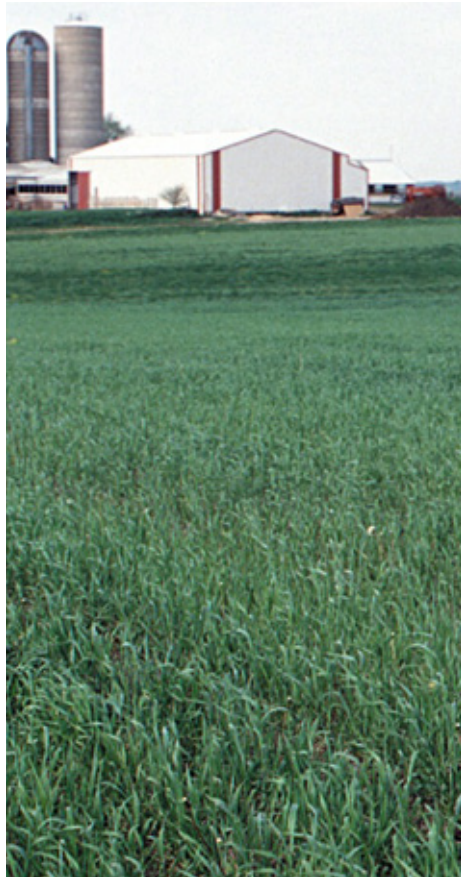
Cover crops on a field in Black Hawk County, Iowa.