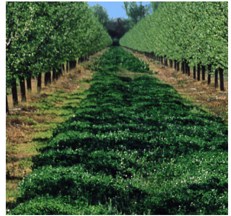
Cover crops in an orchard reduce soil erosion.