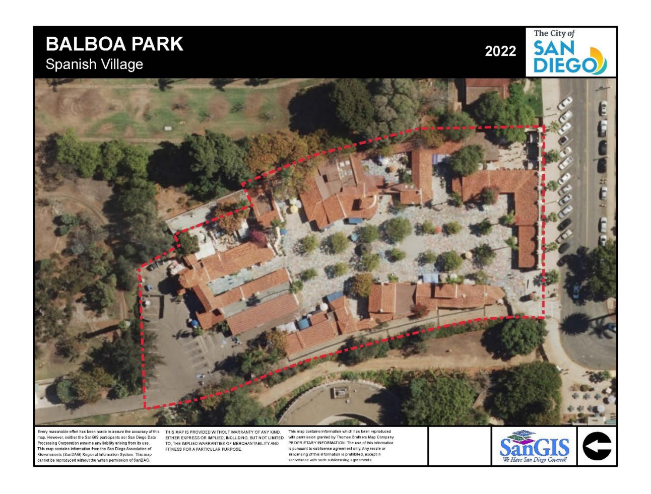
EXHIBIT A PREMISES