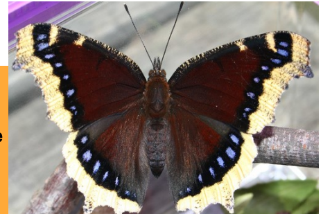
Mourning Cloak ( Nymphalis antiopa ) at Chollas Lake