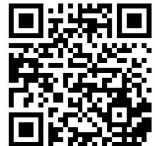
QR Code: SFPD Community Survey

Park Station will utilize community surveys, feedback during community meetings, and dialogue across all communication methods to assess how our community policing efforts are impacting our community's perception of safety, fear of crime, and disorder.