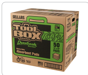
DuraSoak® Pads Outer Case

Caution: Not intended for use with aggressive acids or caustics. Dispose of all sorbent materials in accordance with local, state and federal regulations.