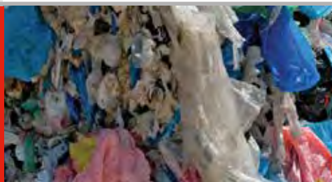
Tons of plastic waste will soon be processed as a liquid fuel and used in the chemical production at Shell Norco, the first global site to implement a new Plastics to Chemical technology.

"Shell recognizes the needs of our customers and society at large to more effectively manage and re-use plastic waste."