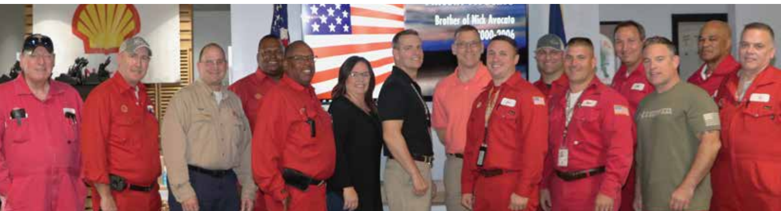
Norco veterans and active-duty military personnel were honored for their years of service to their country during the site's annual Veterans Day celebration.