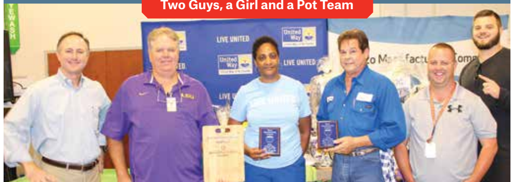
Two Guys, a Girl and a Pot were the champions in the NMC United Way Gumbo Cookoff.