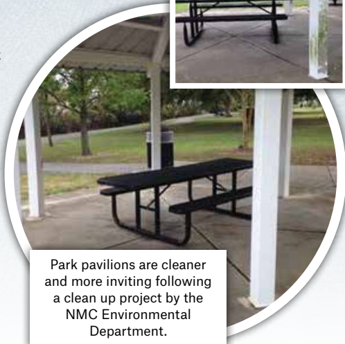
Park pavilions are cleaner and more inviting following a clean up project by the NMC Environmental Department.