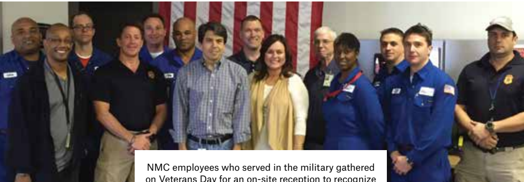
NMC employees who served in the military gathered on Veterans Day for an on-site reception to recognize their contributions to the country.