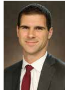
JOSH DIVINE Solicitor General

Unit receiving the majority of consumer complaints. The Consumer Protection section works to mediate those complaints between businesses and individuals to resolve issues without litigation or further legal action. When mediation is unsuccessful, civil litigation and potential criminal prosecution are considered. Under Attorney General Bailey's leadership, the office has recovered millions in restitution for consumers.