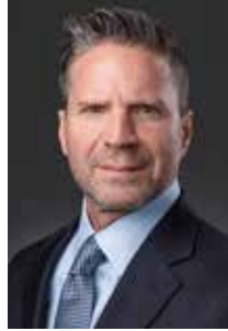
DOUGLAS JACOBY Commissioner of Securities

The Registration Section reviews proposed securities offerings to ensure Missouri registrations are "fair, just and equitable." The office receives filings of federally covered securities, reviews requests for exemptions from registration requirements and assists issuers seeking to raise capital in compliance with the law. This section also regulates the registration of individuals and firms, performs routine and for-cause inspections and pre-registration exams of the offices of broker-dealers and investment advisers. Prior to granting each registration, an application review process is conducted to determine if applicants