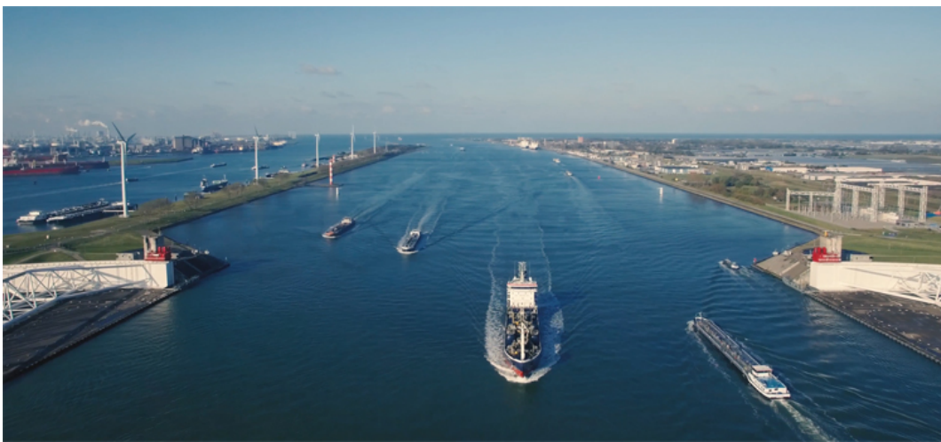
Figure 7-3. Maeslant storm surge barrier in the Netherlands - Width: 360m (1180 ft); Depth: 17m (56ft)

The choice for a barge gate will reduce the risk of not opening. Also, maintenance of gates can be done in dry docks if needed. It is noted that a one barrier solution has been chosen for the Maeslant barrier which has a total channel width of about 360m (1080 ft) – Figure. 7-3.