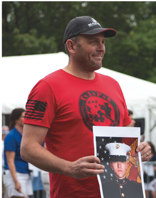
Right: A survivor holds a photo in memory of a fallen Marine loved one during the National Memorial Day Parade in Washington, D.C., May 28, 2018.