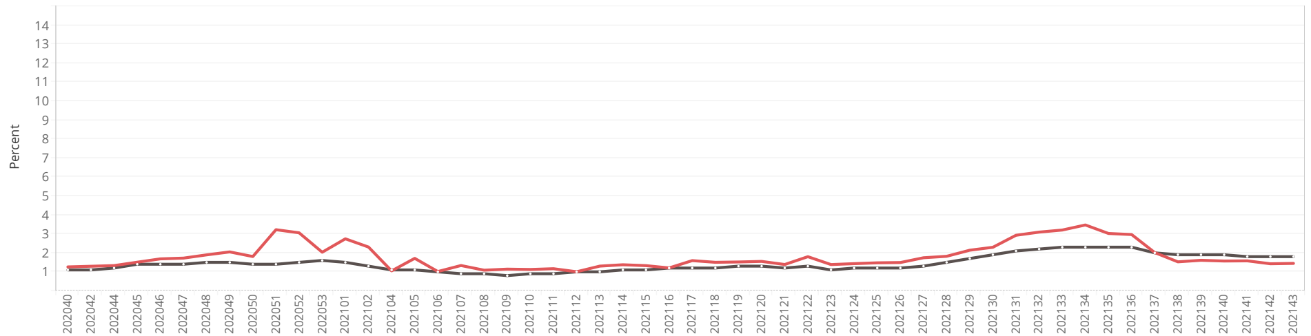
Percentage of Outpatient Visits Reported as Influenza-Like Illness by the U.S. and Tennessee ILINet, 2020 to 2021