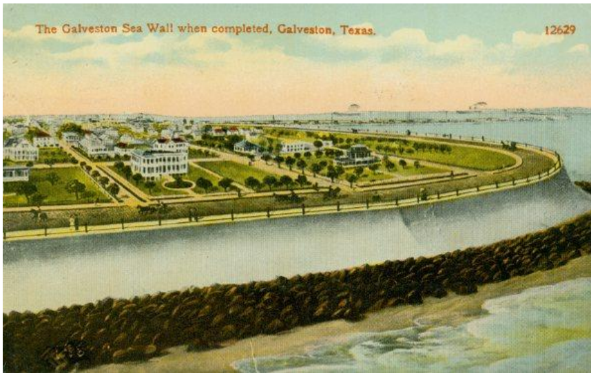
Postcard, The Galveston Sea Wall, before 1915. Postcards of Texas Collections, Prints and Photographs Collection, Texas State Library and Archives. 1961/8-149.