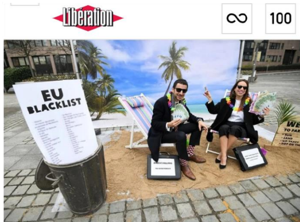
Manifestation d'Oxfam contre les paradis fiscaux en décembre 2017 près des institutions européennes à Bruxelles.

In his remarks at the High-Level Dialogue on