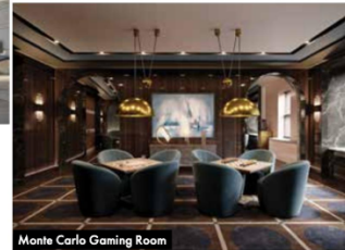
Monte Carlo Gaming Room

after their engagement in 1956; The Winter Garden, a relaxing verdant lounge and bar next to the Starlight Pool; The Starlight Lounge and Bar, named as an homage to the Waldorf Astoria's famed Starlight Roof, aka the nightclub of choice in the 1930s and '40s; and The Presidential Library Bar, which honors every president who stayed or lived in the famous hotel.