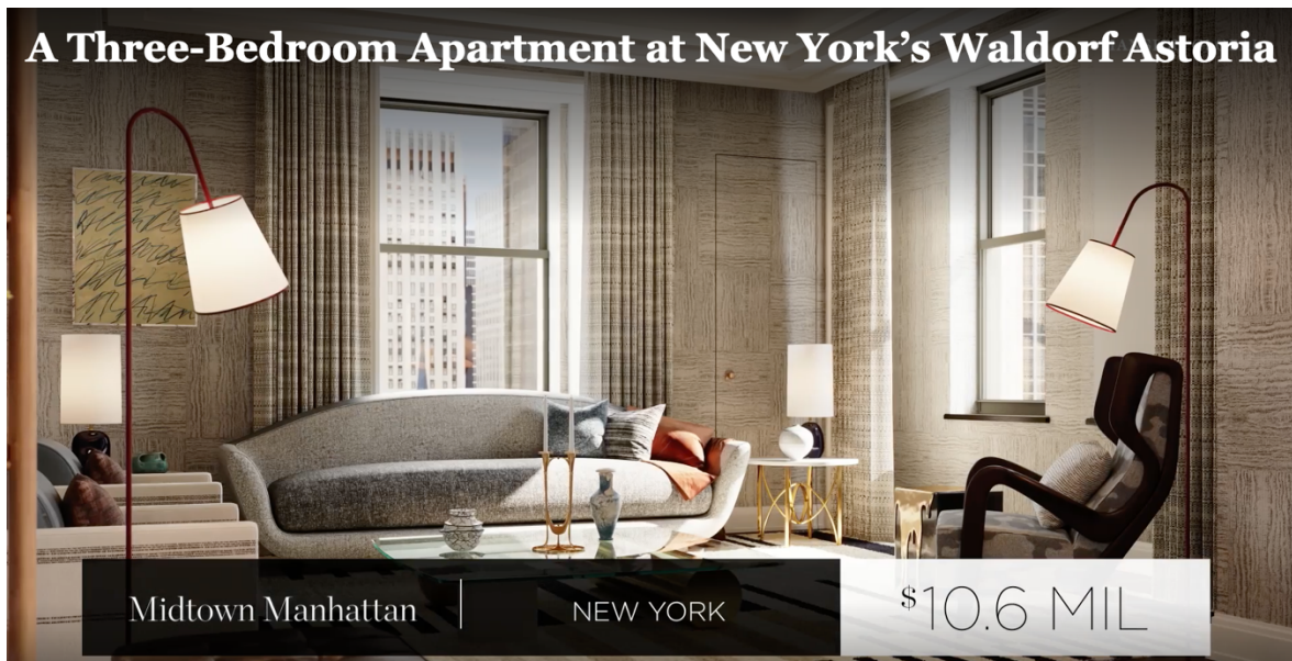
A Three-Bedroom Apartment at New York's Waldorf Astoria