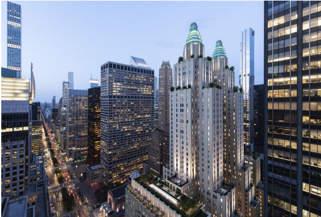
The Waldorf Astoria is considered to be an outstanding example of classic Art Deco architecture.

Celebrating 91 years on Manhattan 's Park Avenue this year, the Waldorf Astoria was the tallest and largest hotel in the world when it opened in 1931; it was also among the most luxurious and is considered to be an outstanding example of classic Art Deco architecture .