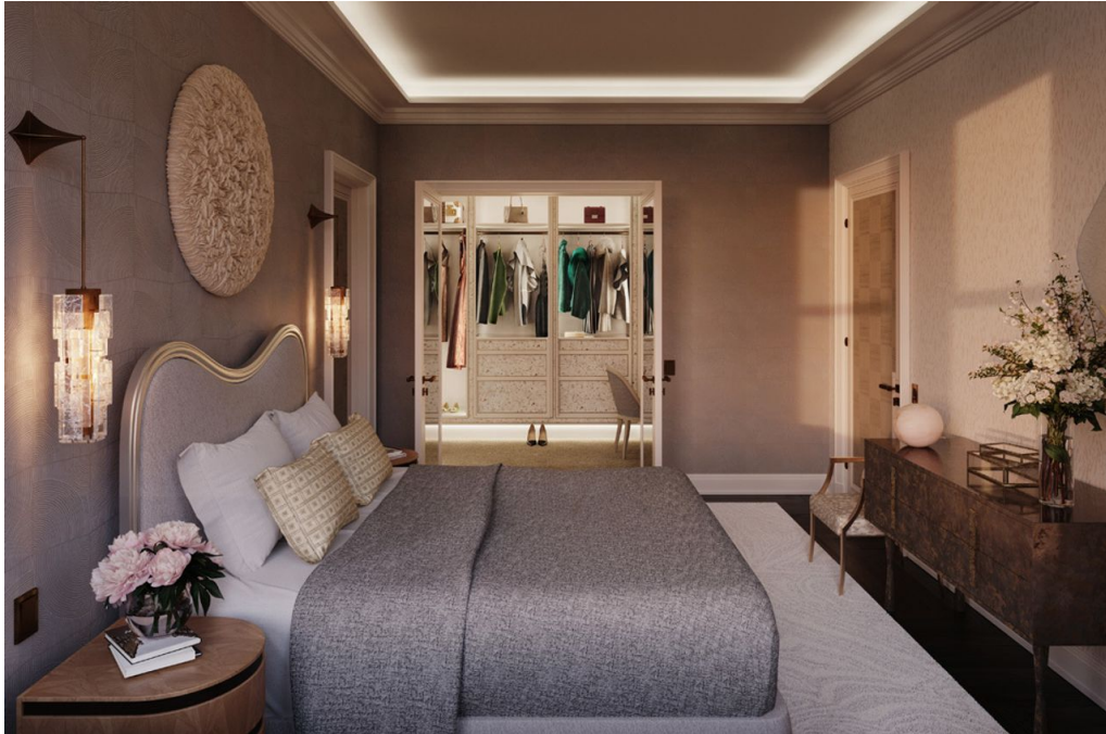
The primary suite stands out for its two walk-in closets and bathroom with a generously sized freestanding soaking tub.