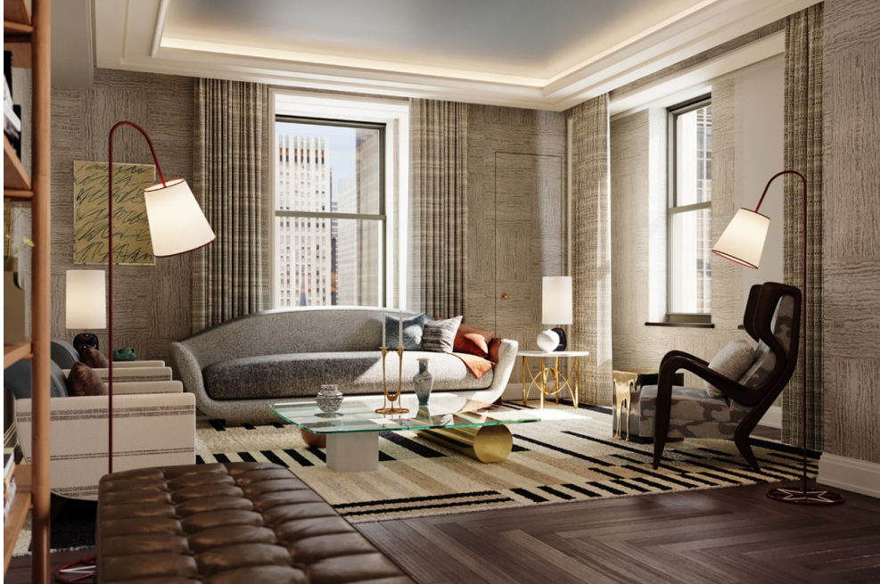
The 2,529 square foot home offers three bedrooms and three-and-a-half bathrooms. NOE & ASSOCIATES / THE BOUNDARY