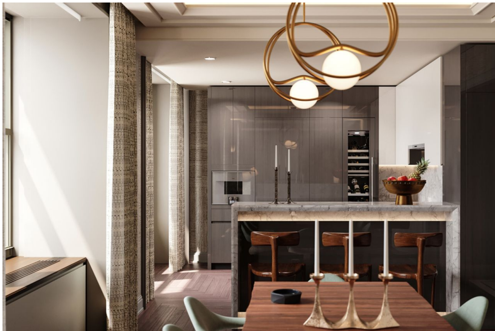
The kitchen features custom cabinets from Molteni and Gaggenau appliances and is just off the gallery that leads to the bedrooms. NOE & ASSOCIATES / THE BOUNDARY