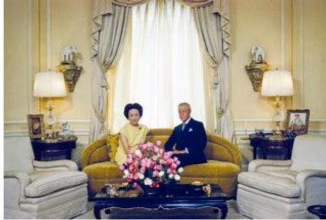
19/21

Wallis, Duchess of Windsor, and Edward, Duke of Windsor American royal-by-marriage Wallis Simpson and her husband, the Duke of Windsor, resided at the hotel's Towers for years. The Pennsylvania-born duchess reportedly heard talk of the Waldorf's Royal Suite designated for Queen Elizabeth's visit and felt it only fitting to demand 42R for herself and husband Edward VIII. Her room was painted a powder blue shade that went on to become known as Wallis Blue.