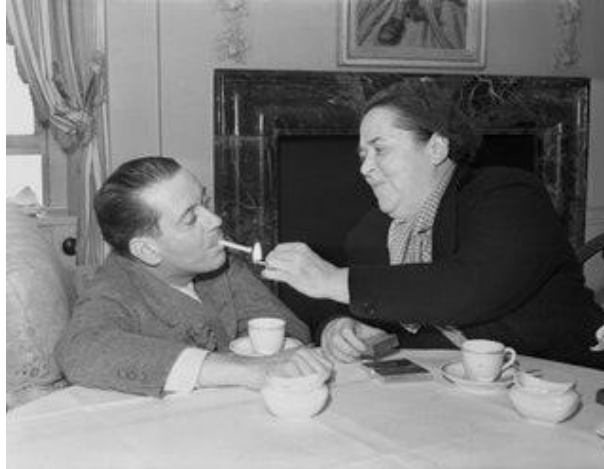
3/21 Cole Porter