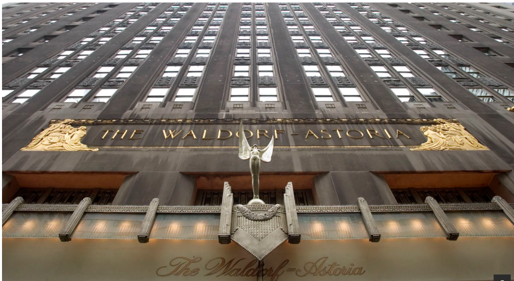
The Waldorf Astoria has been undergoing renovations since 2017.

By: Charlotte Collins Impressions: 4,945,783