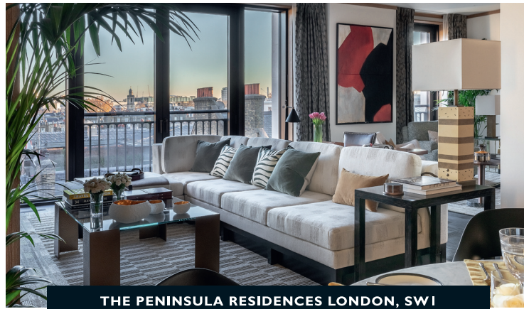
THE PENINSULA RESIDENCES LONDON, SW1 Located in Belgravia, with views across Buckingham Palace Gardens and Wellington Arch, this collection of 25 apartments and penthouses sits alongside the new Peninsula Hotel, which offers fantastic amenities including a spa, restaurants, and a shopping arcade of luxury boutiques, POA. peninsula.com

While staying in a top-notch hotel is viewed by most people as a rare treat, the lucky owners of these branded residences can savour la belle vie as much as they choose – making every day feel like a holiday.