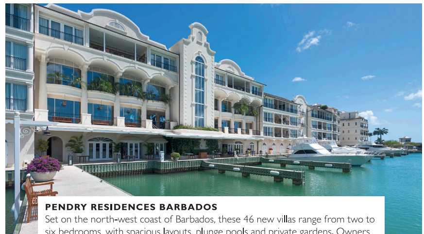
PENDRY RESIDENCES BARBADOS Set on the north-west coast of Barbados, these 46 new villas range from two to six bedrooms, with spacious layouts, plunge pools and private gardens. Owners get access to the amenities and services of Pendry Port Ferdinand, as well as a berth at the nearby marina. From $2.5 million. pendry.com