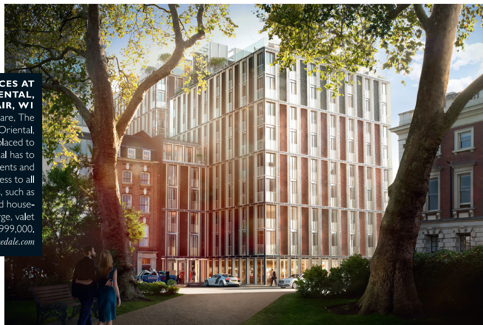
THE RESIDENCES AT MANDARIN ORIENTAL, MAYFAIR, W1 Situated on Hanover Square, The Residences at Mandarin Oriental, Mayfair, are perfectly placed to enjoy everything the capital has to offer. The apartments and penthouses come with access to all the hotel facilities, such as in-residence dining and house-keeping, 24-hour concierge, valet parking and spa. From £1,999,000. clivedale.com