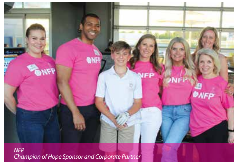
NFP Champion of Hope Sponsor and Corporate Partner