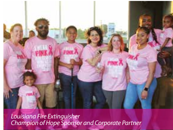
Louisiana Fire Extinguisher Champion of Hope Sponsor and Corporate Partner