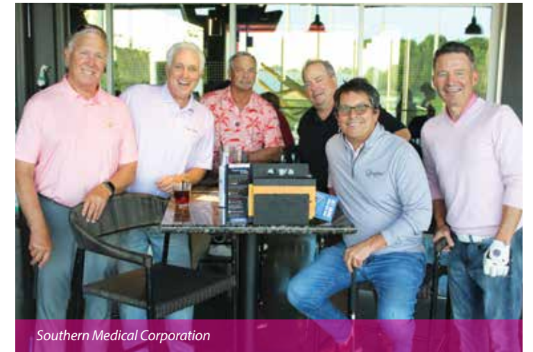
Southern Medical Corporation