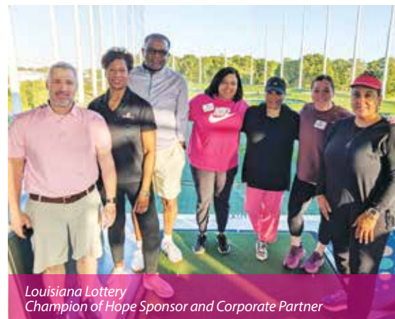
Louisiana Lottery Champion of Hope Sponsor and Corporate Partner