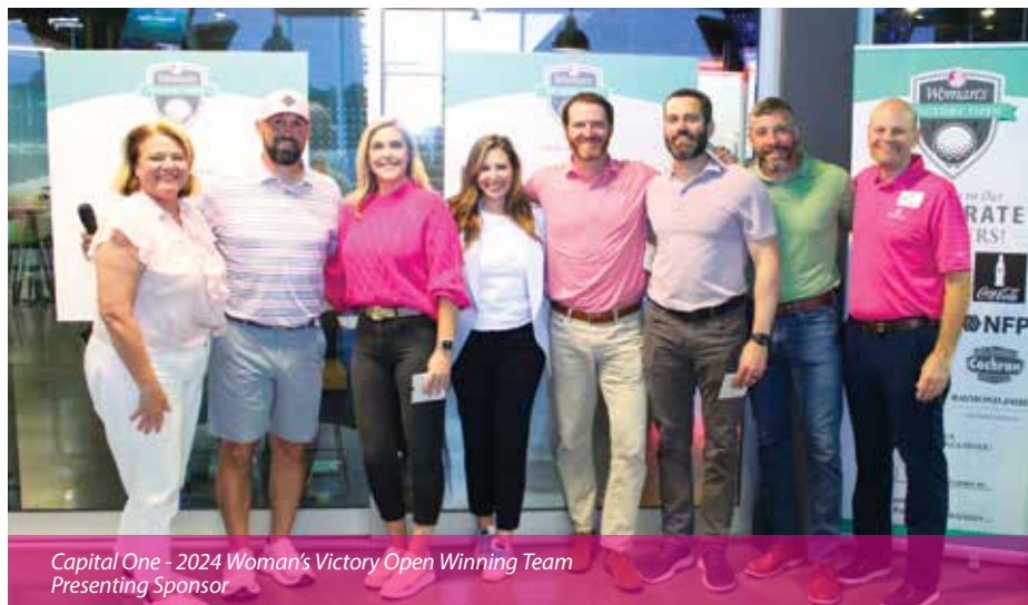
Capital One - 2024 Woman's Victory Open Winning Team Presenting Sponsor