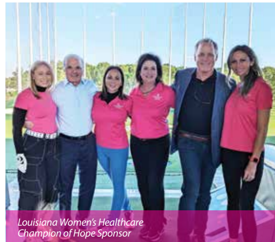
Louisiana Women's Healthcare Champion of Hope Sponsor