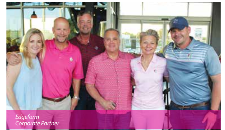
Edgeform Corporate Partner