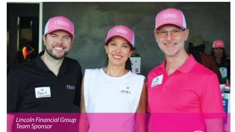
Lincoln Financial Group Team Sponsor