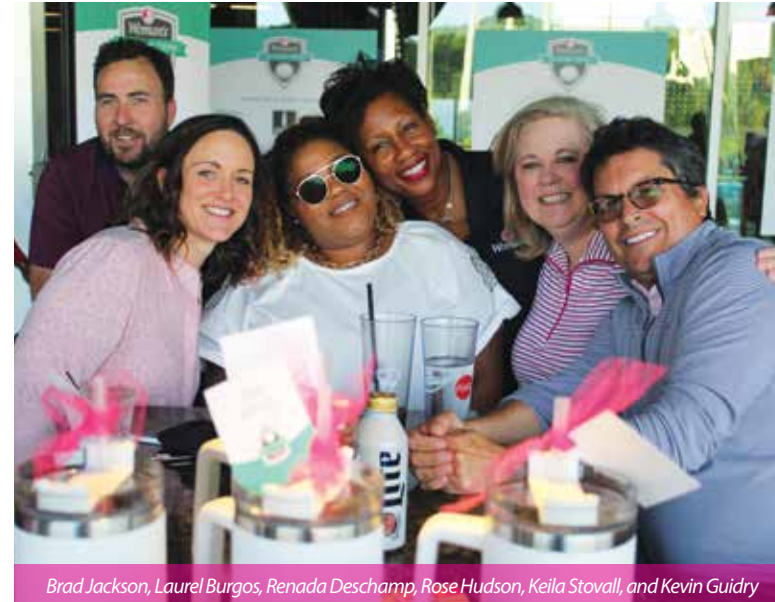
Taylor Porter Awards Reception Sponsor