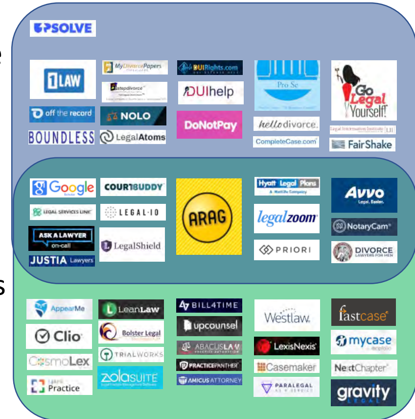
Representative Online Legal Services (Consumer)