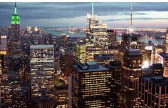
"View from the top of the Rock, New York"

It's OK to thoughtfully and strategically expand your practice areas after your firm is established, but falling victim to practice creep too soon can not only increase your chances of getting sued for malpractice, but also take your time and energy from matters you are already equipped to handle.