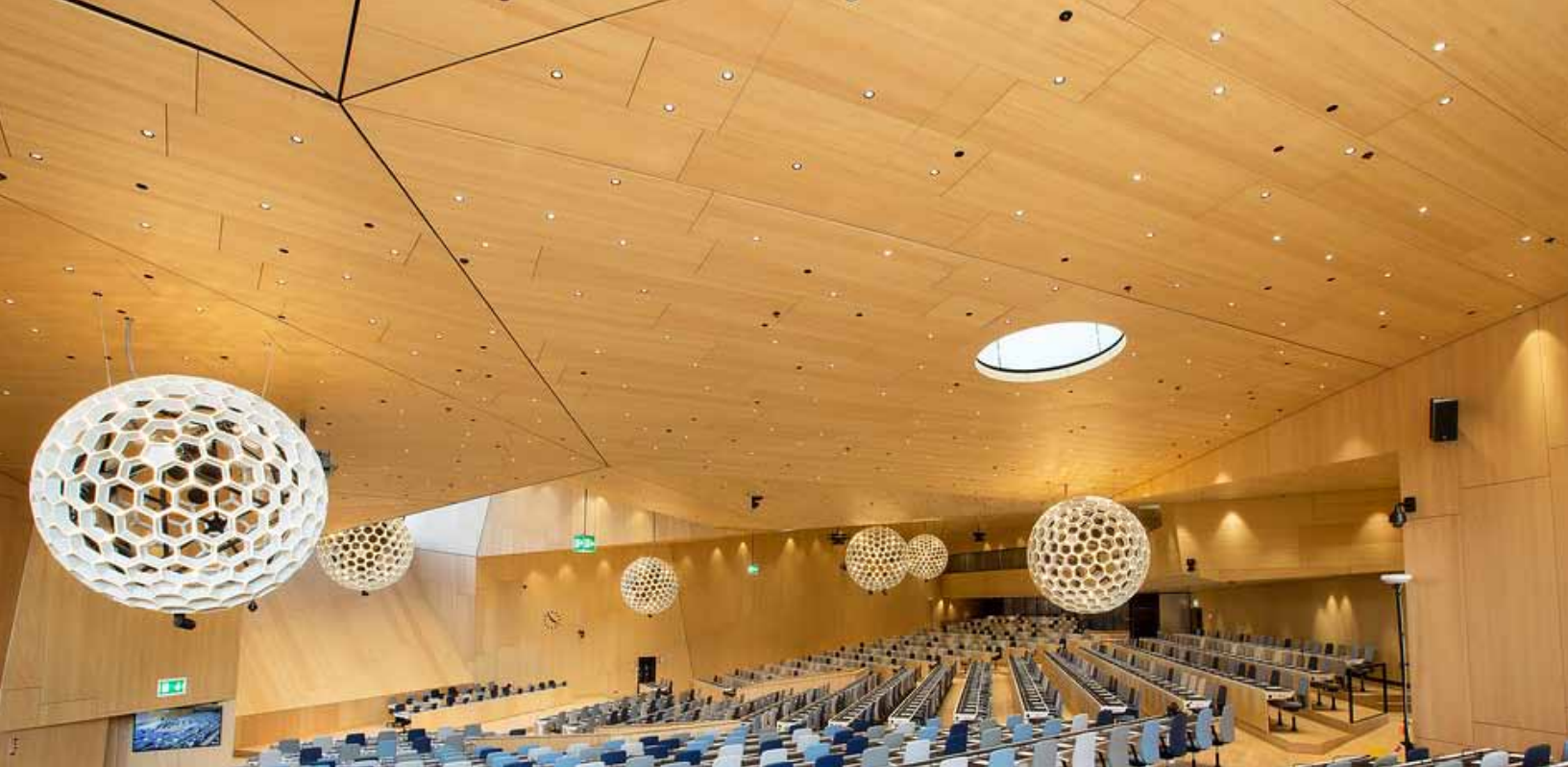
"WIPO Conference Hall" by WIPO | OMPI, licensed under CC BY-NC-ND 2.0