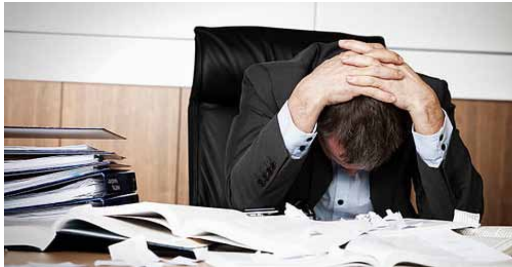
“Frustrated business person overloaded with work. - Credit to https://www.lyncconf.com/ ”

But what does this have to do with implementing technology? Well, I suggest first looking at the processes in your firm that are least efficient. For example, does your firm require clients to download, print, sign, scan, and email back documents? Why? Many people do not own a printer, and especially