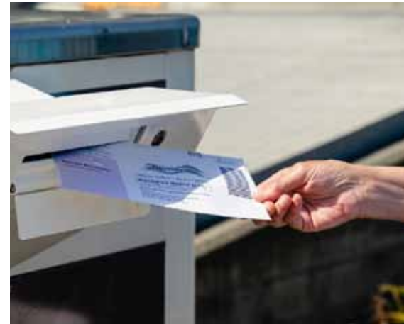
"Everett, WA - USA / 07/30/2020: Dropping Mail in Ballot into mail box" by ShebleyCL, licensed with CC BY 2.0.

Nevertheless, most relevant to the subject matter at hand