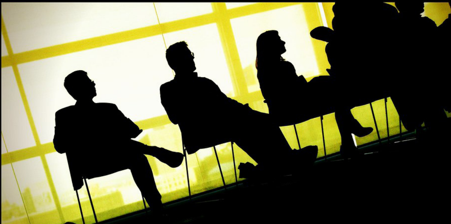
"Business meeting"