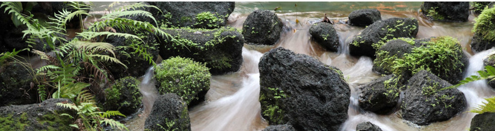
"Water Flows"

I appreciated and enjoyed the opportunity to serve as chair, and look forward to the coming year.