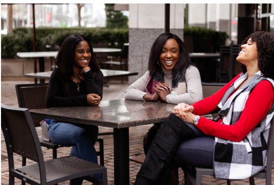
"Women friends laughing"