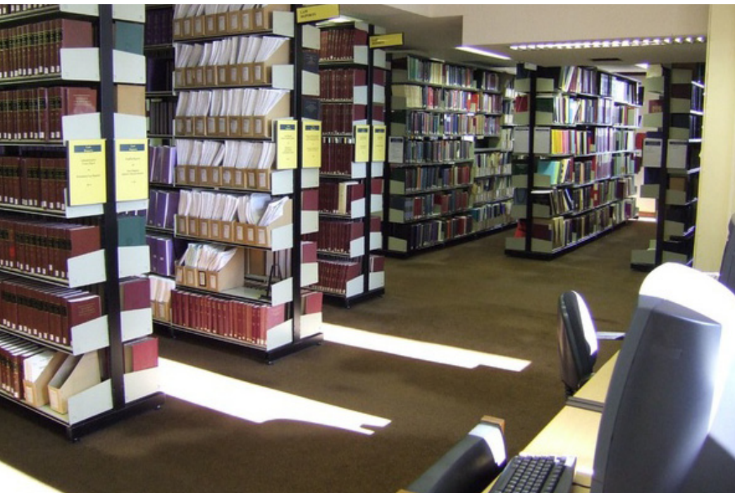
"Law Reports and Law Books Shelving"

along with a fantastic selection of Washington practitioner resources including the WSBA Deskbooks, the Washington Lawyers Practice Manual, and all the Lexis Washington Practice Guides.