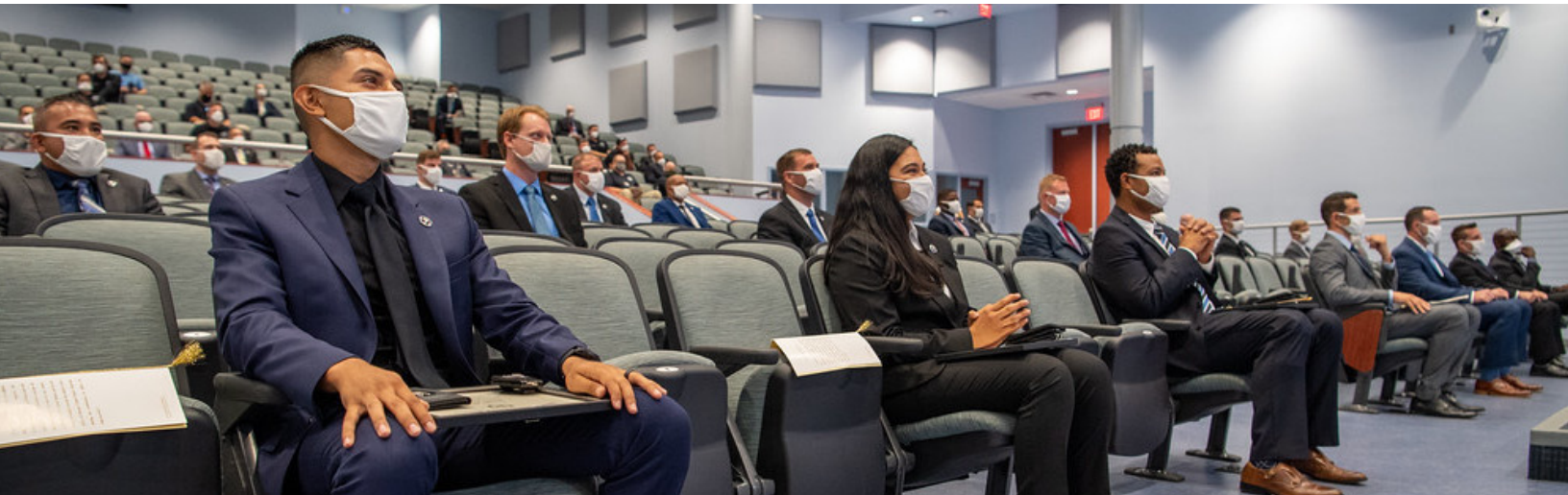
"Academy Class 2005-552"