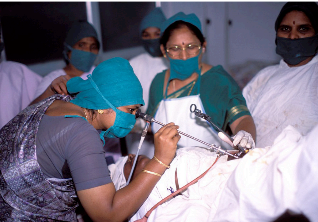
“A doctor performs an operation” by World Bank Photo Collection licensed under CC BY-NC-ND 2.0