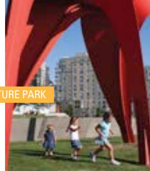
OLYMPIC SCULPTURE PARK