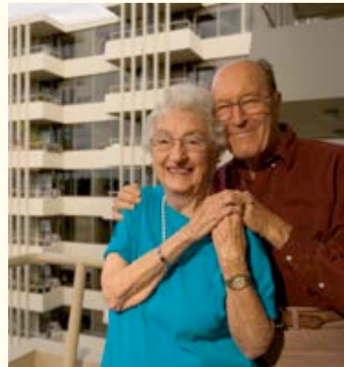
BELOW Residents at the Hearthstone continuing care retirement community in Seattle’s Green Lake area.