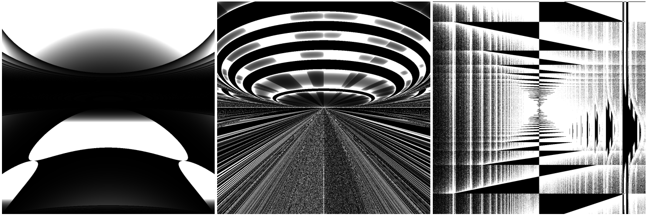
Figure 1: Example of collaboration between two agents. On the left is a solitary image by a fractal dimension agent, on the right by an entropy agent. On the center is an artifact the agents made in collaboration, showing traits from both agents.

thetic goal g . The closer the objective aesthetic measure calculated from the artifact is to the goal, the more valuable the artifact is. The value is a linear mapping of the distance from the aesthetic goal, calculated with the following formula: