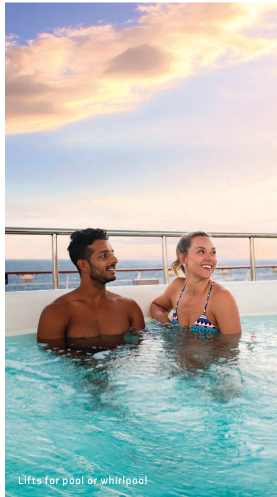
Lifts for pool or whirlpool