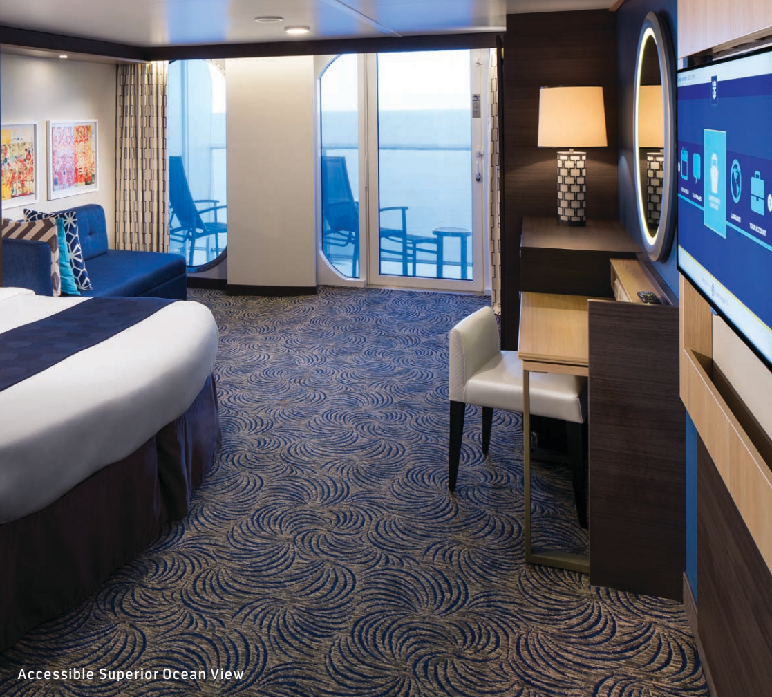
Accessible Superior Ocean View