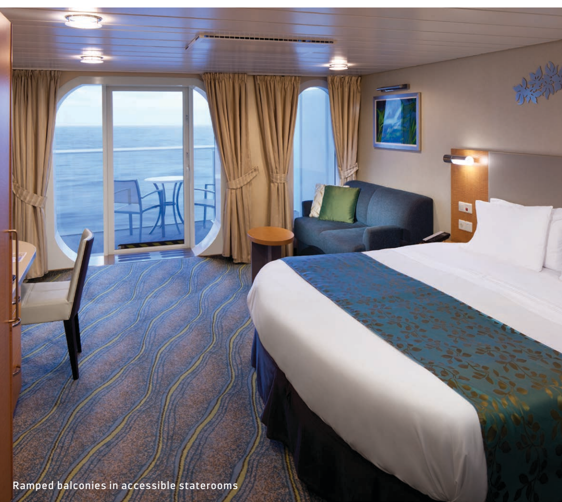
Ramped balconies in accessible staterooms