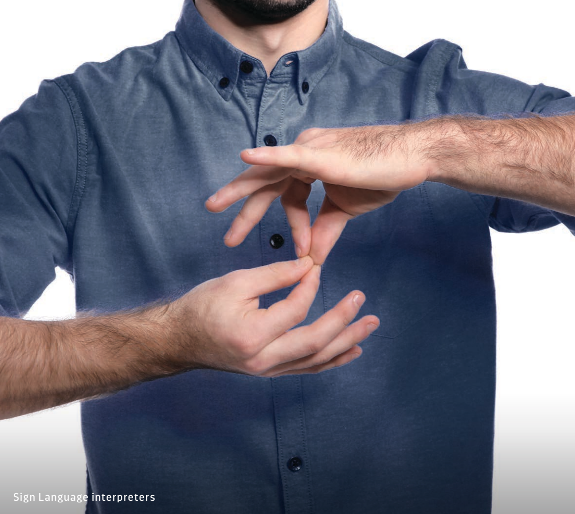
Sign Language interpreters