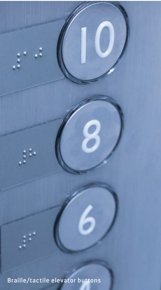
Braille/tactile elevator buttons