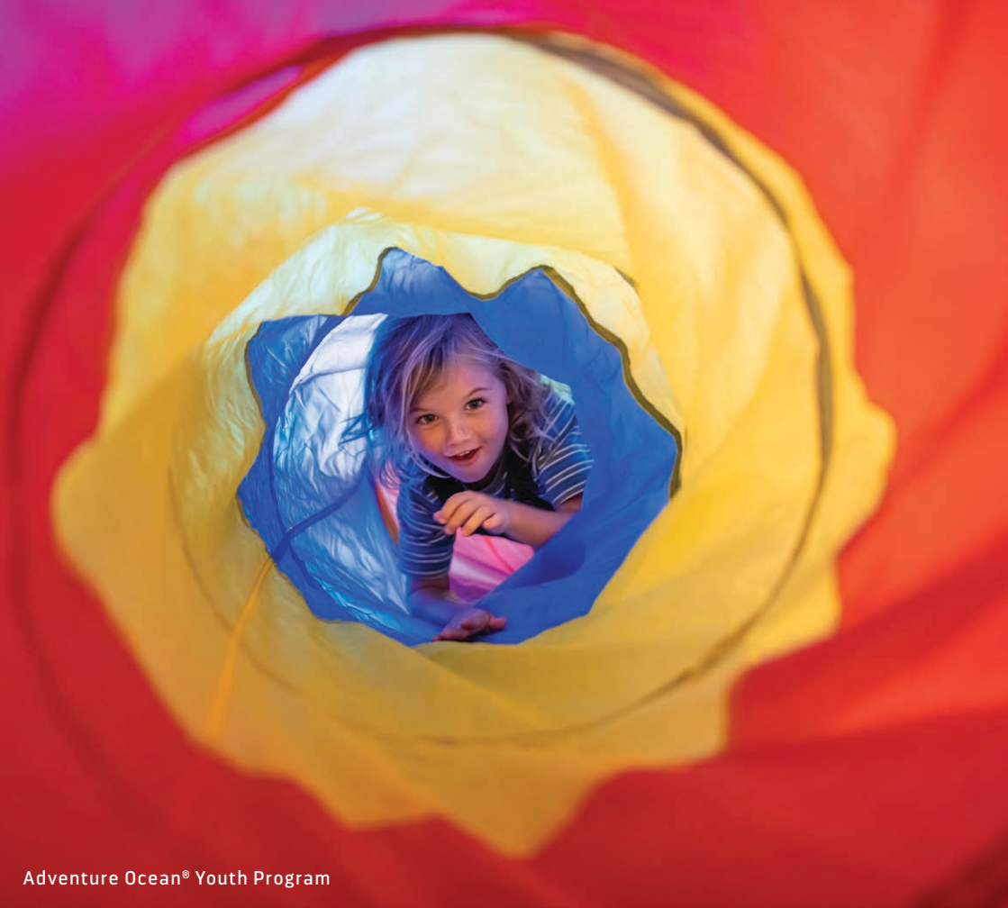
Adventure Ocean® Youth Program