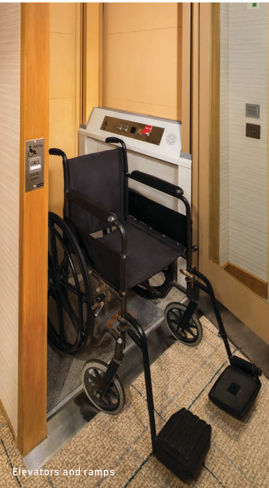
Elevators and ramps