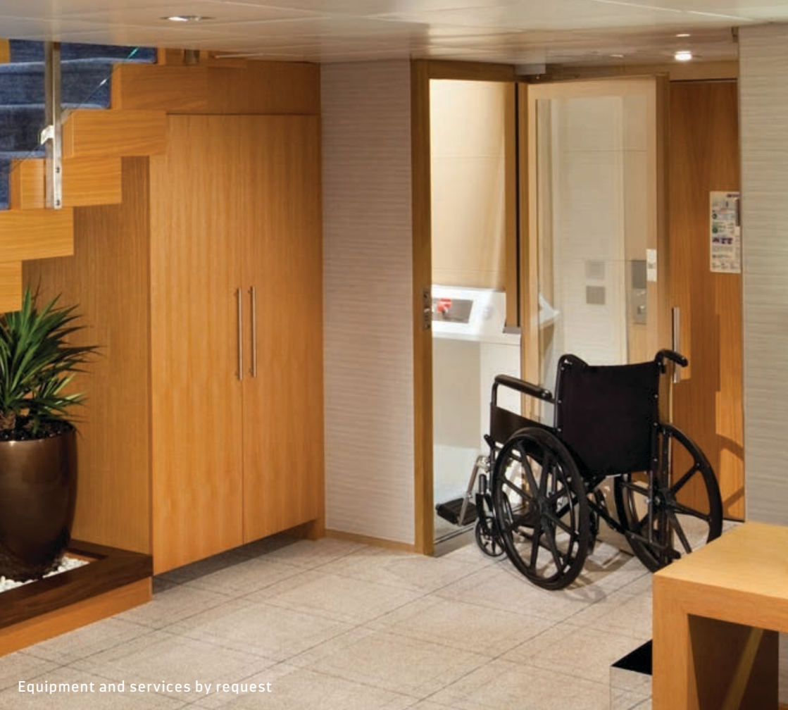
Equipment and services by request