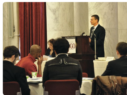
A LOOK INTO ONE OF POGO'S CONGRESSIONAL OVERSIGHT TRAININGS

Last but not least, POGO continues to cultivate a burgeoning community of online advocates. Through Facebook, Twitter, LinkedIn, and a host of other networks, POGO has spread the "provoke accountability" message far and wide, engaging with followers from all over the country. And we'd love for you to get involved. If you haven't had a chance to yet, be sure to follow us on Twitter, "Like" our page on Facebook, and sign up for email updates by visiting our homepage—that way you can be sure you won't miss a beat.