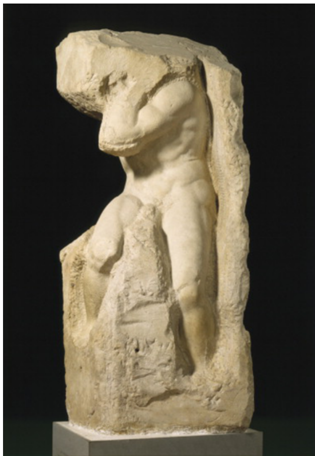
Fig. 1. Unfinished “captive” by Michelangelo Buonarroti.

Is such adaptation a good thing or a bad thing? The concept of partner affirmation describes whether the partner is an ally, neutral party, or foe in individual goal pursuits (Drigotas et al., 1999). As noted in Figure 2, affirmation has two components: Partner perceptual affirmation describes the extent to which a partner consciously or unconsciously perceives the target in ways that are compatible with the target’s ideal self. For example, John may deliberately consider the character of Mary’s ideal self, consciously developing benevolent interpretations of disparities between her actual self and ideal self. Alternatively, if John and Mary possess similar life goals or values, John may rather automatically perceive and display faith in Mary’s ideal goal pursuits.