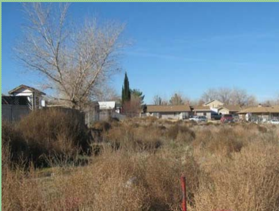
These dry and dead tumbleweeds are within 100 feet of adjacent structures. ACWM would require the removal of this extreme fire hazard.

Antelope Valley Air Quality Management District