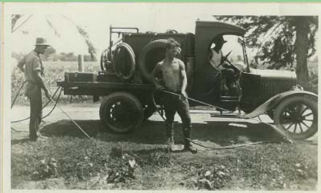
ACWM employees attempting to eradicate puncturevine in the San Fernando Valley in about 1938.

One of ACWM's missions has always been to attempt to control the spread of invasive weeds and in 1990, launched a major effort aimed at tumbleweeds. The initial plan to perform widespread tumbleweed burning proved highly controversial so ACWM reconsidered and discovered that carefully timed seasonal mowing not only destroyed existing tumbleweeds in place, but also the mulch left behind helped to prevent them from growing back the next year. Many areas of the Antelope Valley that were once almost a sea of tumbleweeds have experienced a type conversion or habitat change back to grassland with currently little or no tumbleweeds (see photos below). ACWM's fight with tumbleweeds is not over yet, but the invasive plant has never again reached the levels experienced at the beginning of the program.