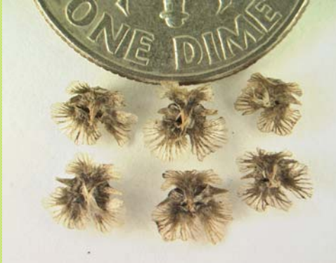
Tumbleweed seeds. A large plant can produce as many as 200,000 of these!