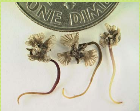
Tumbleweed seeds with the taproots uncoiled and ready to search for moisture. This process can take as little as 12 hours giving tumbleweeds a competitive advantage over many plants under low moisture conditions.