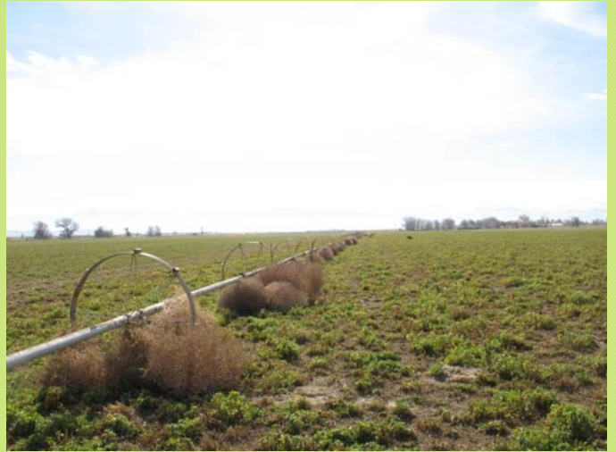
Tumbleweeds can pile up on automated irrigation equipment, such as the one shown in this photo, causing damage to the irrigation equipment.