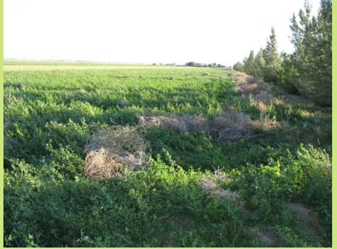
Tumbleweeds can blow into agricultural fields and take considerable effort to remove by hand.

Many individuals are allergic to the plant's pollen and sap causing dermatitis (skin rash) and rhinitis (runny nose). Their movement by the wind across roadways and busy intersections causes traffic hazards. Blown into waterways and canals they clog and disrupt what would otherwise be the free flow of water and a mass of tumbleweeds in a swimming pool are a minor disaster.