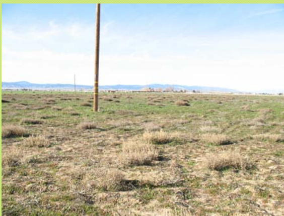
ACWM would not require removal of the tumbleweeds scattered across the property above if it remained in this condition.