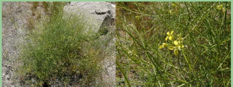
Tumble mustard ( Sisymbrium altissimum )