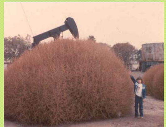
ACWM archival photo of a young boy standing next to a very large tumbleweed at an unknown location.

The following guidelines are specific to tumbleweeds. Please click on the following link for general weed abatement information related to the Weed Abatement Program .