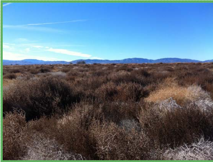
Tumbleweeds on a vacant lot in the Antelope Valley.