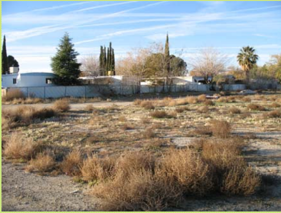
This photo is an example of the condition of a parcel that the owner should call ACWM in order to determine whether clearance is necessary.