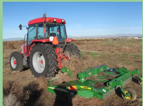
A tractor with a mowing attachment. Carefully timed seasonal mowing has been an effective method in the battle against the spread of tumbleweeds.