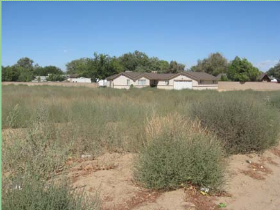
ACWM does not consider green tumbleweeds to be a public nuisance, but they may be abated along with annual weeds if occurring amongst them.