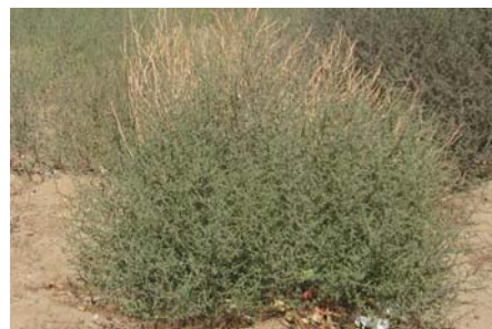
Russian thistle is commonly referred to as tumbleweed.

The climate, geography, periodic high winds and other factors make the Antelope Valley area of Los Angeles County vulnerable to the growth and spread of tumbleweeds. Fortunately, the destructive and nuisance potential of tumbleweeds has diminished over the last 20 years as a result of a cooperative effort of many Antelope Valley property owners and the Los Angeles County Department of Agricultural Commissioner/Weights and Measures (ACWM).