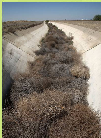
Tumbleweeds in an irrigation canal.