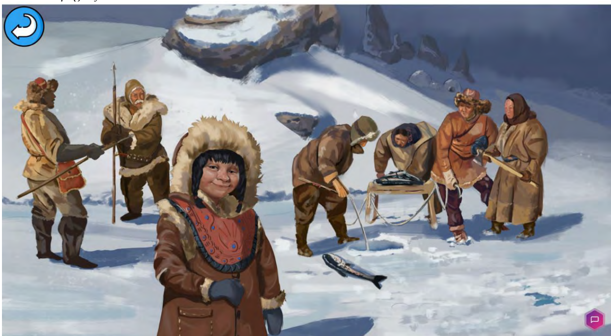
Chat homepage of Kirima