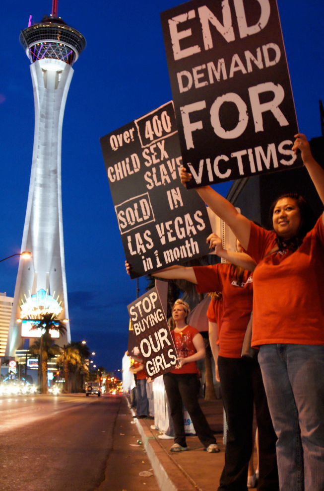
In 2009, Shared Hope rallied activists in The March to End Demand in Las Vegas, Nevada.

Shared Hope identified and targeted for interviews seven professional groups as likely to come into contact with victims of domestic minor sex trafficking: federal, state, and local law enforcement; federal and state prosecutors; juvenile court personnel; juvenile probation and detention personnel; public defenders; child protective services personnel; and social services/non-governmental organizations. Shared Hope conducted a total of 297 interviews and requested statistics from relevant agencies, which were not always available, and where available, typically did not provide separate data on domestic minor sex trafficking—a term and crime with which many interviewees were not yet familiar. In those cases, Shared Hope reviewed the statistics to determine the numbers of suspected domestic minor sex trafficking victims. For example, juvenile detention facility statistics reflecting the number of youth detained under charges of prostitution could be properly counted toward the number of domestic minor sex trafficking victims in that facility since juveniles in prostitution are, by definition, victims of sex trafficking under the federal TVPA. 5 The reliance on extrapolated data reflects the overall lack of effective identification of domestic minor sex trafficking victims and highlights the need for training, as well as data collection, regarding domestic minor sex trafficking.