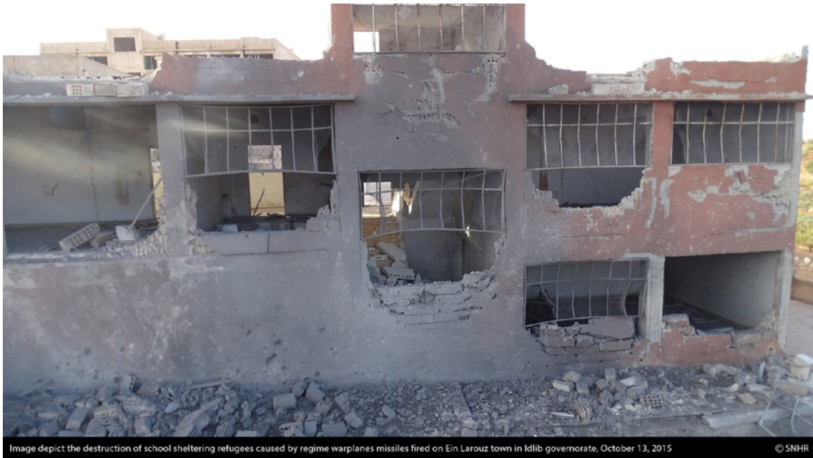
Image depict the destruction of school sheltering refugees caused by regime warplanes missiles fired on Ein Larouz town in Idlib governorate, October 13, 2015

A video that depicts the destruction in the school due to the alleged Russian shelling on Ein Larouz town.