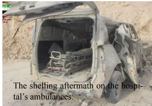
The shelling aftermath on the hospital’s ambulances:

Hama – Al Latamna Town – 23 October 2015: Alleged Russian warplanes shelled Al Latamena hospital with two rockets which led to a great destruction to the hospital’s building and made it go out of service. We realized that an armed opposition headquarters is located almost 20 meters away from the hospital, in addition to a military vehicles garage and an ambulance. The shelling killed 7 individuals (an anesthesia technician and six armed opposition members).