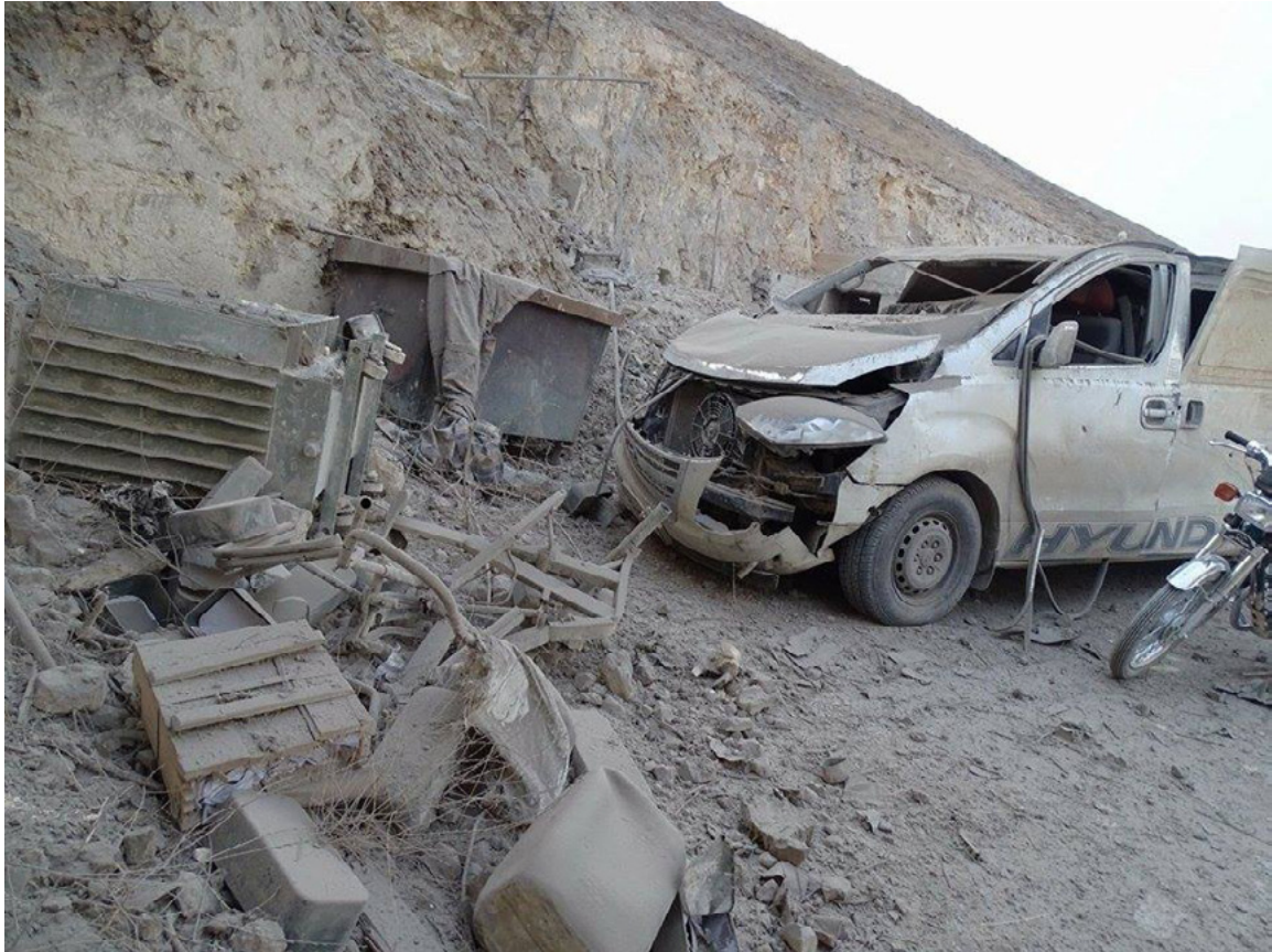
The shelling aftermath on the makeshift hospital in Al Latamna town: