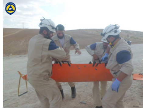
An image that depicts members from the Civil Defense aiding an injured civilian