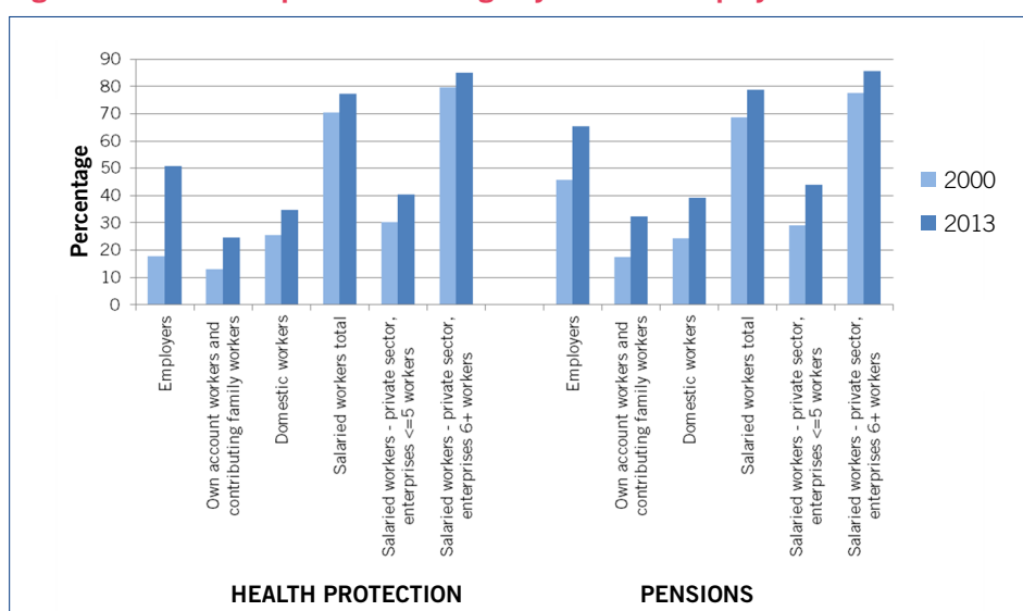
Figure 2. Health and pension coverage by status in employment in Latin America

Note: The graph reflects a regional estimate for Latin America based on available survey data.