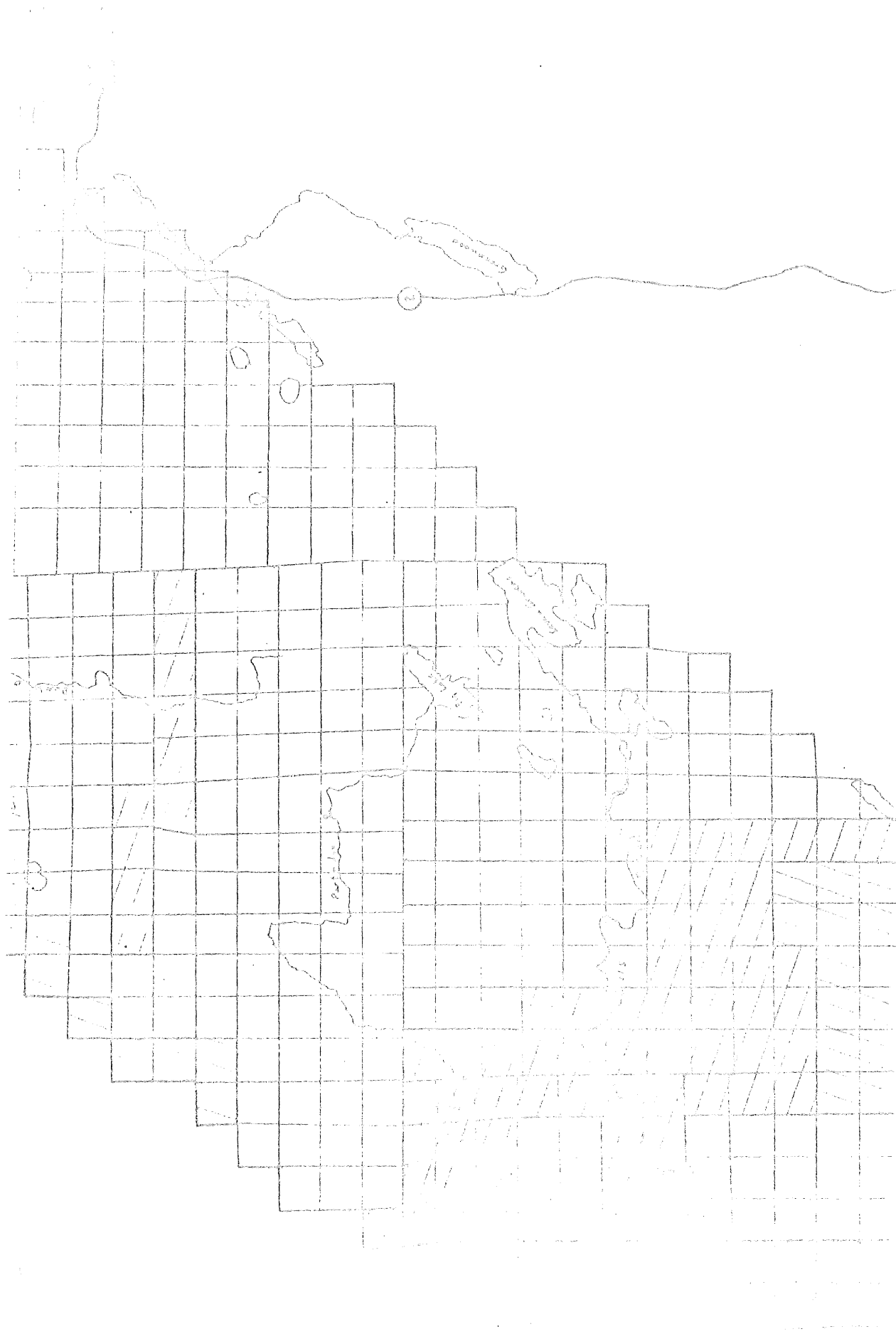
1977-78 WINTER DEER DISTRIBUTION Figure 2

- HIGH DENSITY - MEDIUM DENSITY - LOW DENSITY