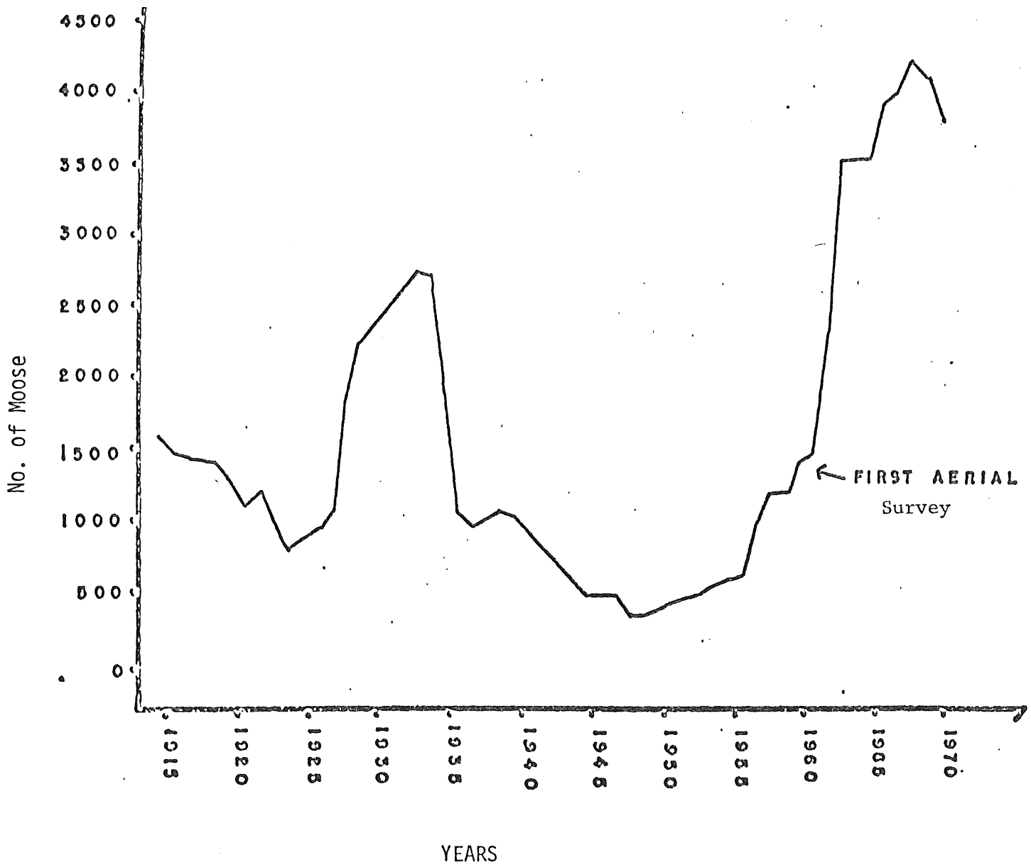
Figure 1. Moose population estimates based on Superior National Forest Records A