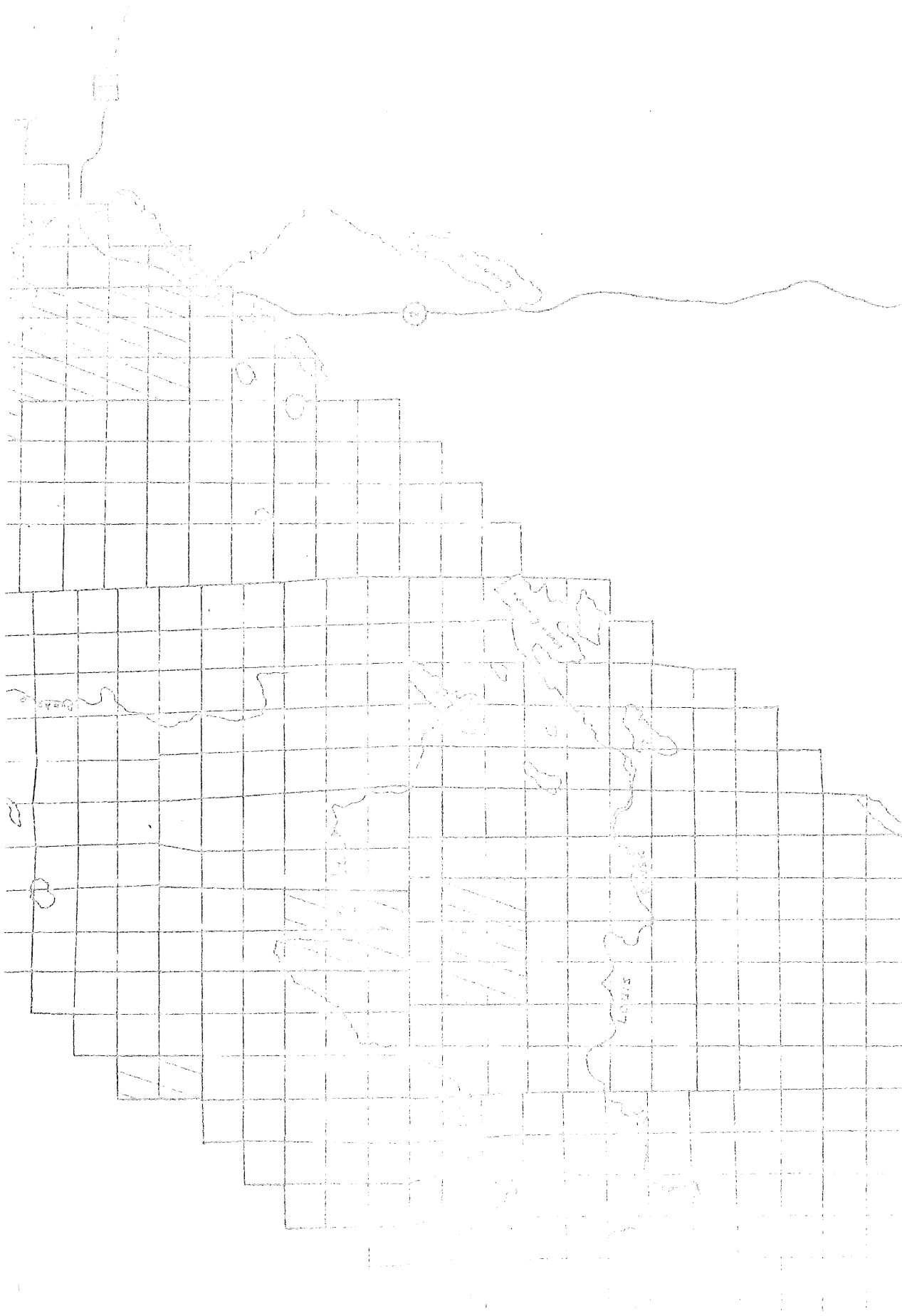
1977-78 WINTER MOOSE DISTRIBUTION Figure 3