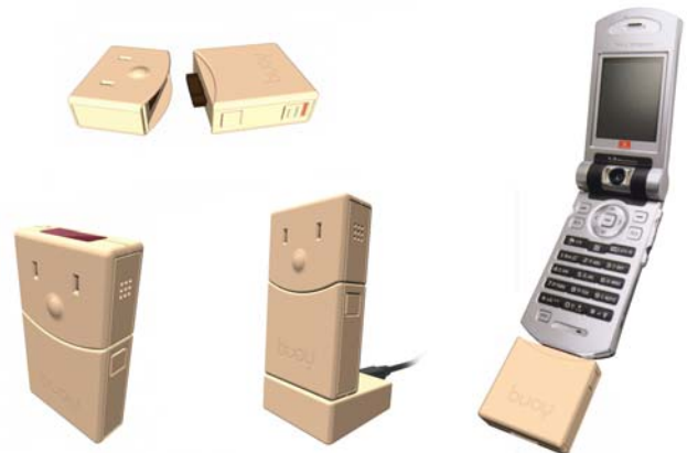
Fig 1: Three variations of the wireless discovery device: the wireless device with an add-on component, a cellular phone and cradle

The Buoy device provides minimum functionality for service discovery. This includes storing/removing advertisements and preferences to/from the Buoy local database, performing service-matchmaking, communicating with a cellular phone or a PC, and broadcasting data.