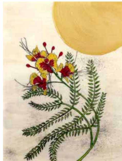
(Peacock Flower, Salyna Gracie.)