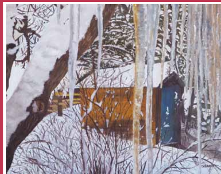
(Garden Shed With Icicles by Susan Donahue.)

LOCATION/HOURS: The Winthrop Gallery is located at 237 Riverside in downtown Winthrop. Fall Gallery hours: 10am to 5pm, Thursday through Monday. INFO: 509-996-3925, winthropgallery.com .