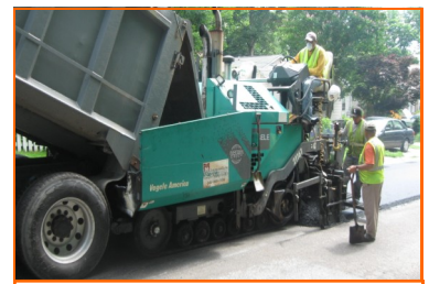
Typical asphalt paving operation