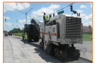
Typical milling operation