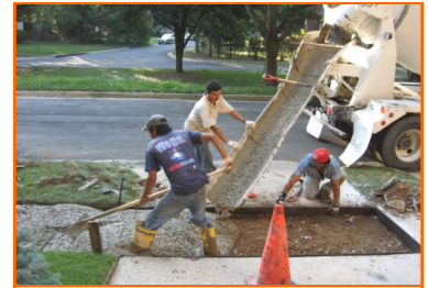
Pouring new concrete into forms