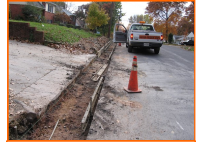
Curb forms being made ready for concrete

Thank you for your cooperation and patience as we work to improve the Franklin Knolls subdivision for residents and users.