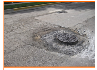
Utilities will be raised to meet new HMA