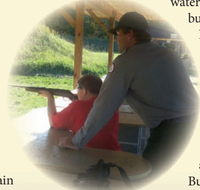
David C. Bertl Shooting Range

Day use fees for the use of designated boat launching ramps and swimming beaches are collected at honor vaults. Annual passes are available from the Project/Administration Building or at campground fee booths.