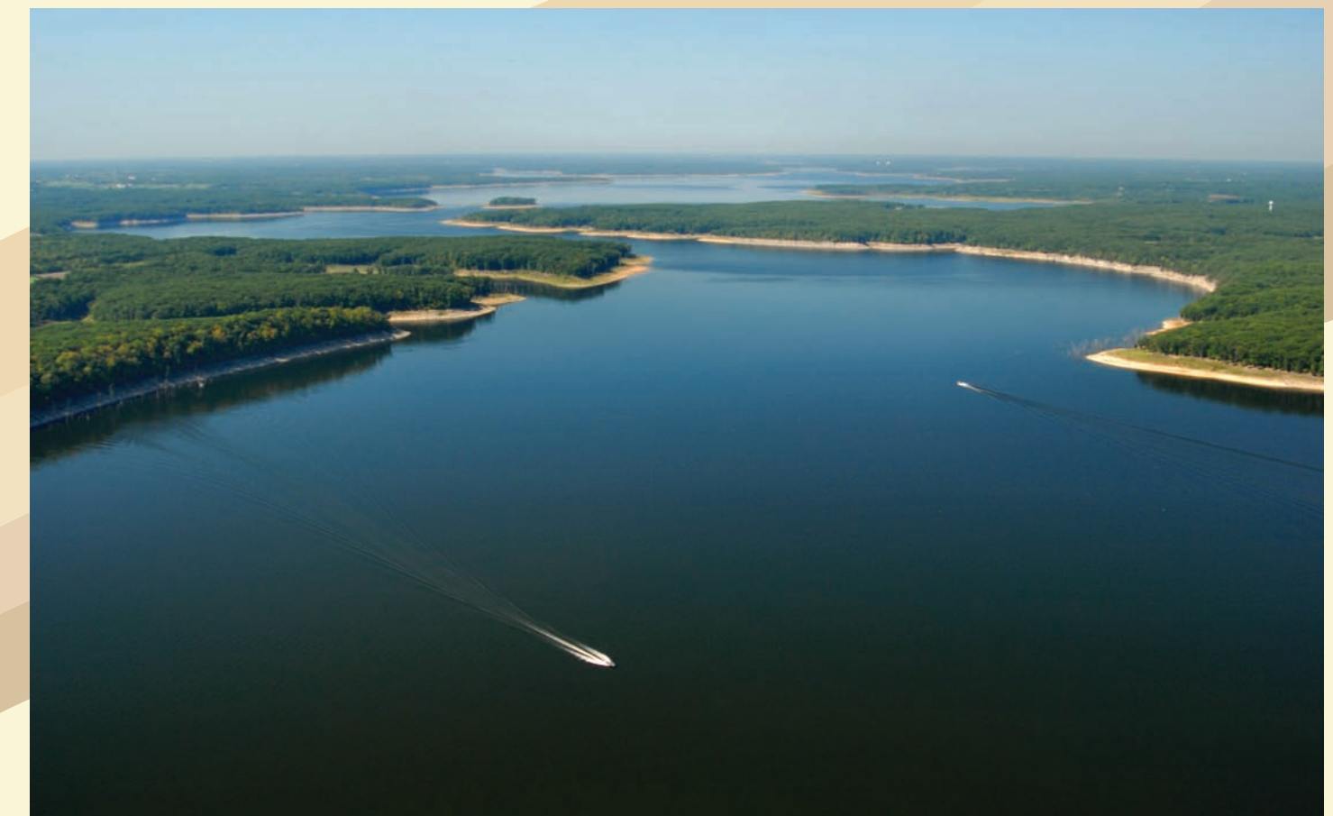
18,600 acre family recreational lake.

The Clarence Cannon Dam contains a hydroelectric power plant capable of producing up to 58,000 kilowatts of power, or enough to supply a town of 20,000 people. The Clarence Cannon hydroelectric plant is powered by falling water. The tremendous force of the water sets the turbine blades in motion which turns the shafts connecting each turbine to a generator. When both units are operating at capacity, as much as 5,400,000 gallons of water pass through the turbines each minute. A re-regulation dam, located 9.5 miles downstream from the main dam, creates a storage pool that helps improve water quality and assists with wetland management.