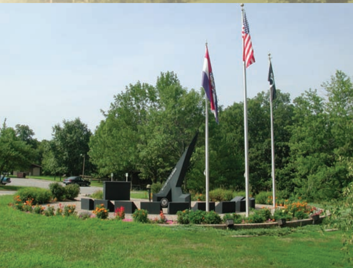
Northeast Missouri Vietnam Memorial