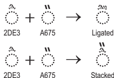
Figure 7-6. Combination of Titlo Letters

A wide variety of composite titlo letters can be encountered in Old Church Slavonic manuscripts, including such combinations as ghe-o , de-ie , de-i , de-o , de-uk , el-i , em-i , es-te , and many others. One of these combinations has been encoded atomically in Unicode as U+2DF5 COMBINING CYRILLIC LETTER ES-TE. However, the preferred representation of a composite titlo es-te is the sequence <U+2DED COMBINING CYRILLIC LETTER ES, U+2DEE COMBINING CYRILLIC LETTER TE>.