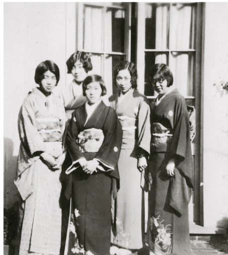
Japanese Women's Student Club Benefit Tea Fund-Raiser; U.C.Y.W.C.A., March 7-8, 1930

In three years, they raised about $2,000, which became the nucleus for the fund that enabled the Japanese Women's Student Club to purchase the former Filipino Student Clubhouse on 2509 Hearst Street. 36