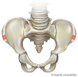
Figure 4: Iliac crest donor site

Hip . The hip is the most common source of bone used for alveolar cleft repair. The donor site, located at the top, outer edge of the hip, is called the iliac crest (also called the wing of the pelvis ). The bone of the iliac crest is plentiful and works well for grafting. To harvest the bone (remove it), the surgeon makes a 2-inch cut near the waistline.