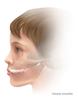
Figure 7: Splint stabilizing the upper jaw

A splint looks like a retainer. It is made of acrylic and attaches to the upper teeth with wires. A surgeon may recommend that a child wear the device for a few weeks to months after surgery. Wearing the splint can make eating and talking difficult. During this time, a child will follow a special diet (see below for more information).