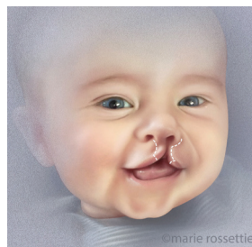
Figure 1 Example of incisions for lip surgery

During lip surgery, the surgeon cuts the tissue near the cleft and rearranges it to close the opening of the cleft and reshape the upper lip (there is no need to take tissue from other parts of the body for this procedure). The newly arranged tissue should enable a child to make an "O" shape with the mouth. The muscles of the upper lip and mouth are important for eating and speech. The drawing to the right shows how the incisions may be planned.