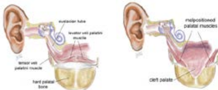
Figure 2a & 2b: A comparison of normal palatal muscles and cleft palatal muscles

The middle ear is connected to the back of the throat by the Eustachian tube. The Eustachian tube opens every so often, such as when you yawn or swallow. This action balances the air pressure between the middle ear and the outside of the ear. It also allows outside air into the middle ear. When your ears “pop” on an airplane, your Eustachian tubes are working.