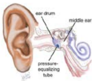
Figure 4: An ear tube in place in the eardrum