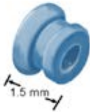
Figure 3: A myringotomy (pressure-equalization) tube