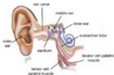
Figure 1: Normal ear showing the eustachian tube and the palatal muscle

Behind the eardrum is the middle ear. The middle ear is filled with air. It also contains tiny bones that connect the eardrum to the inner ear. The inner ear contains the cochlea, the hearing organ. It also holds nerve endings that carry sounds to the brain.