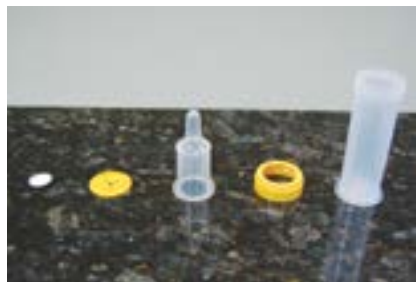
The Haberman Special Needs Bottle Made by Medela