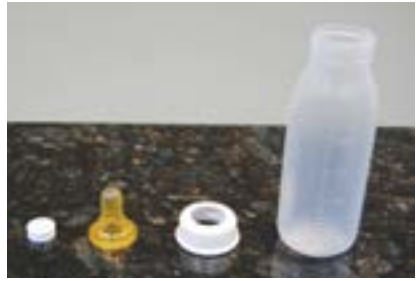
The Pigeon Bottle Made by Respirationics

Again, this hard side should always be on top under the baby's nose.