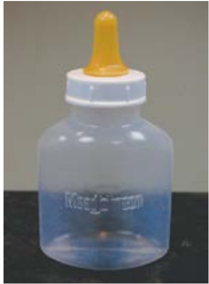
The Enfamil Cleft Palate Nurser by Mead Johnson

This bottle takes a little bit of practice, but once you've used it a few times, you'll feel much more comfortable. The best way of knowing how hard to squeeze the bottle is to keep track of how long it takes to feed your baby. If it's taking longer than 30 minutes, you need to squeeze the bottle a little harder. If you're staying in the 30-minute time frame, and your baby is satisfied